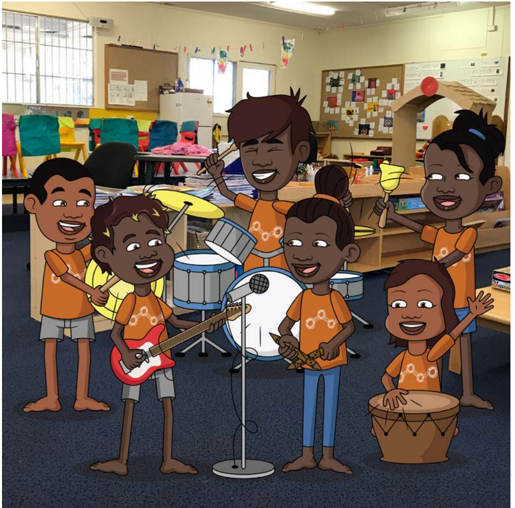
The kid's band